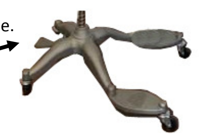
Step 3: Insert the spring over the Inner Pole until it is sitting on the base.

Step 4: Hold down the foot pedal while you use one hand to manually align the "slits" on the top of the inner pole. As you continue to hold down the foot pedal use your other hand to